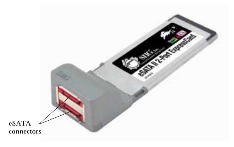
Figure 1: eSATA II 2-port ExpressCard